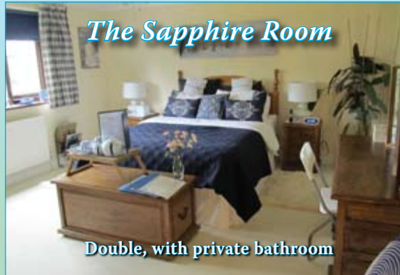
Double, with private bathroom