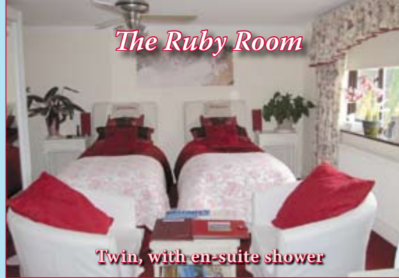
Twin, with en-suite shower

All bedrooms have television, wireless internet, fridge, tea/coffee facilities, and bathrobes.