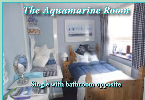
Single with bathroom opposite