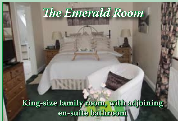
King-size family room, with adjoining en-suite bathroom